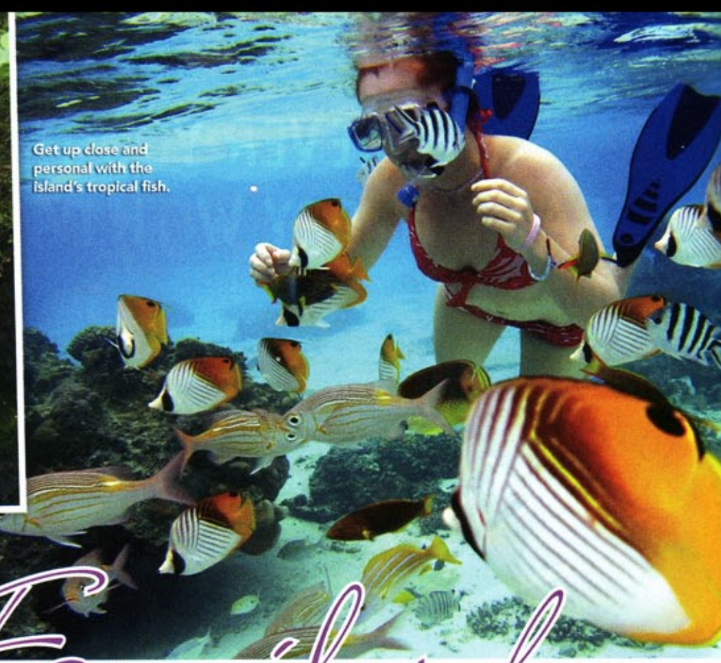
Get up close and personal with the island's tropical fish.

BE CAREFUL AT THE RAROTONGAN BEACH SPA AND RESORT – YOUR CHILDREN MAY NOT WANT TO LEAVE!