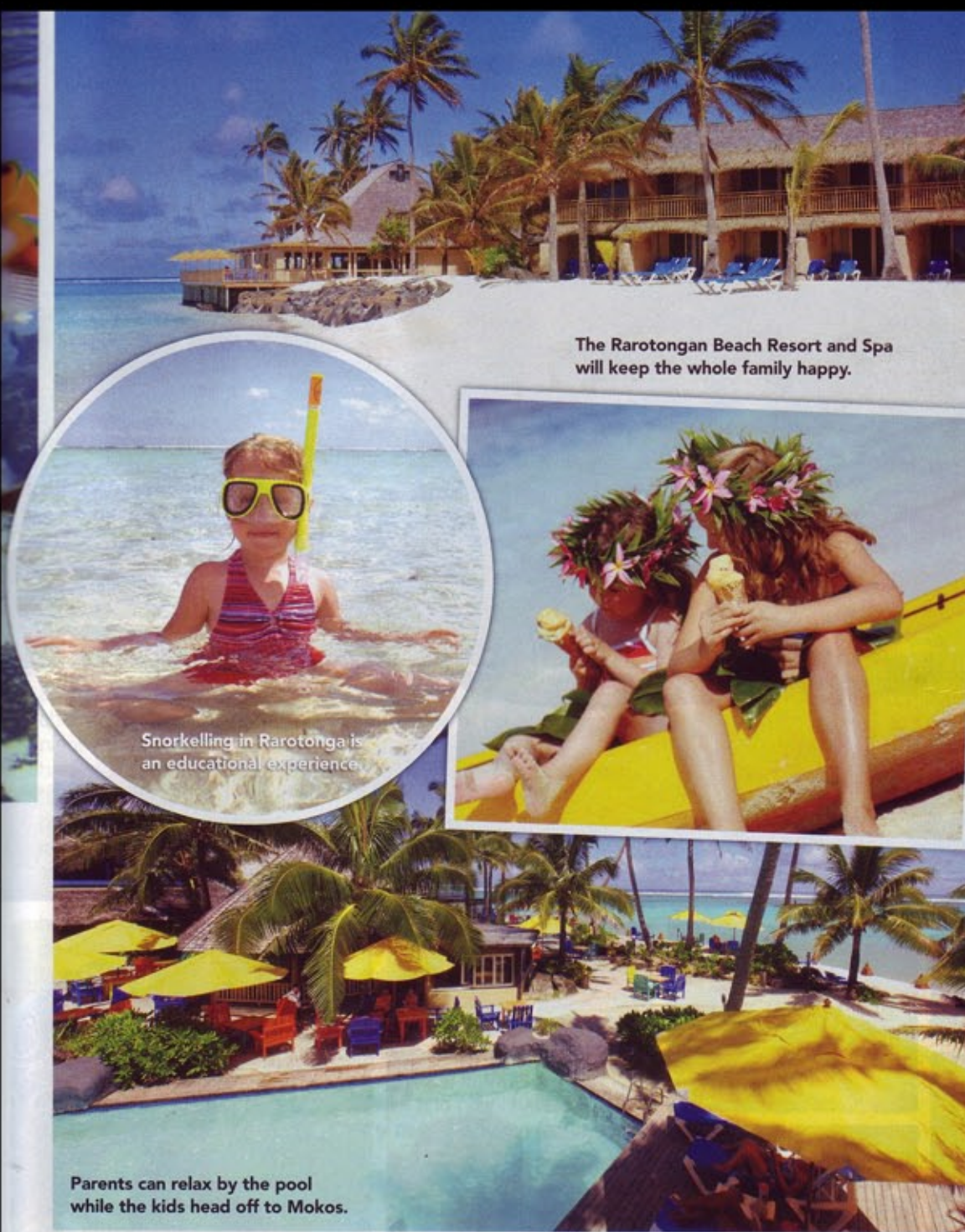
The Rarotongan Beach Resort and Spa will keep the whole family happy.