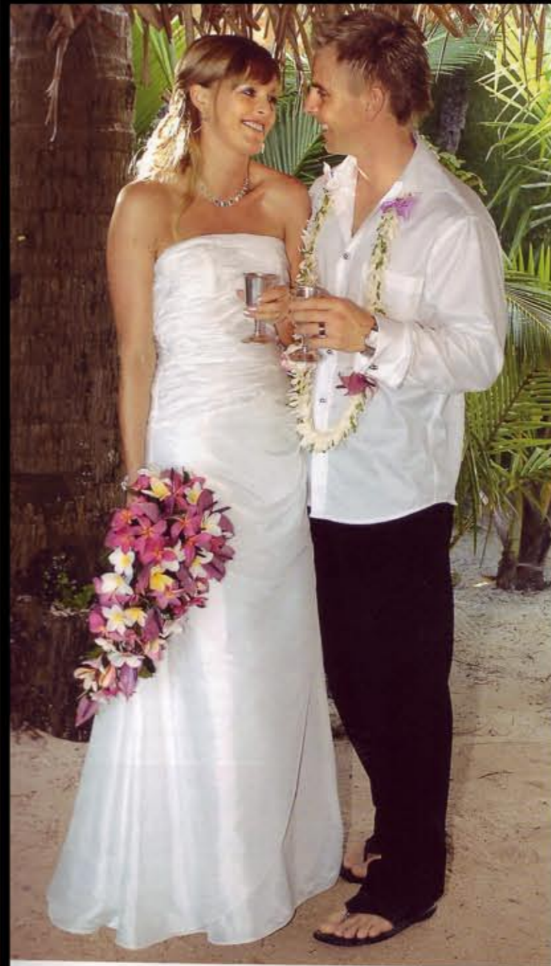
"We wanted a relaxed wedding with a feeling of intimacy"