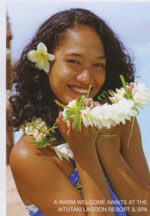
A WARM WELCOME AWAITS AT THE AITUTAKI LAGOON RESORT & SPA