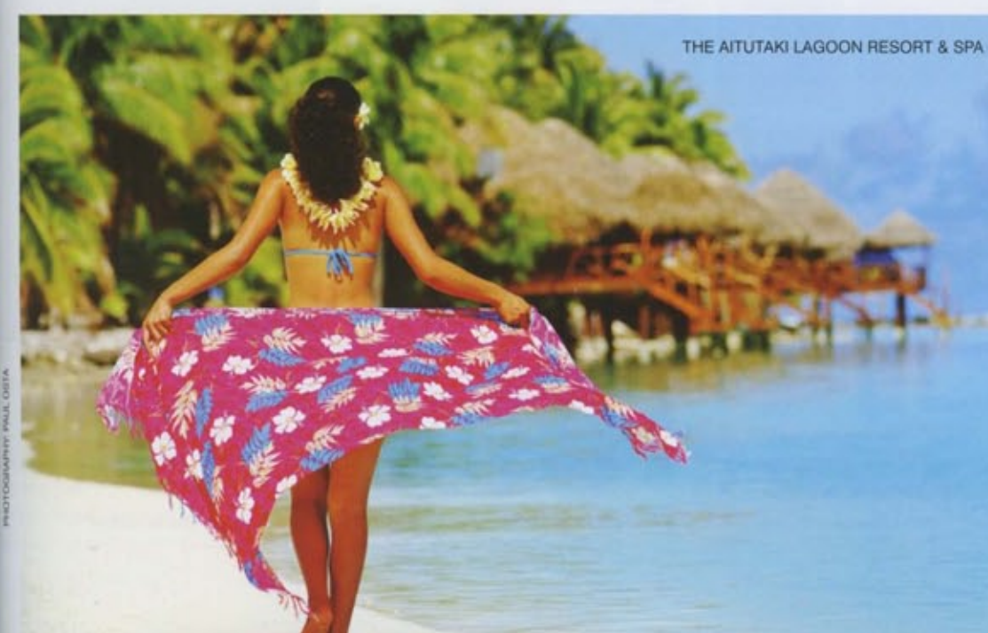
THE AITUTAKI LAGOON RESORT & SPA

It certainly doesn't hurt that the Cook Islands are dripping in sensual references. The Cooks' signature style of hula is said to be the sauciest in the Pacific, with one 19th century missionary famously declaring the gyrations "positively obscene". For an entertaining insight into why he was so miffed, and to soak up more soulful music, be sure to catch Island Night, held regularly at Rarotonga's resorts.