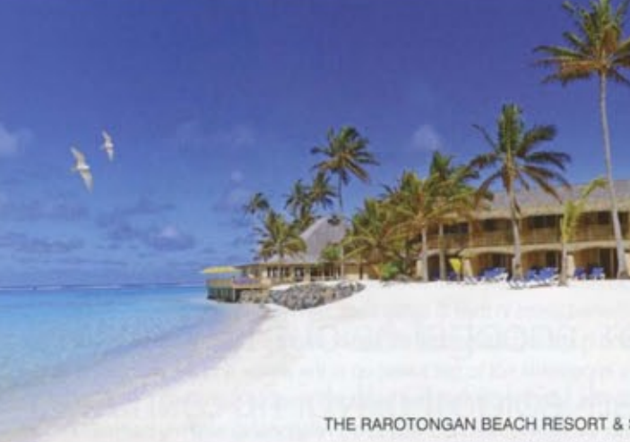
THE RAROTONGAN BEACH RESORT & SPA

Best time to go? Anytime is perfect. If you travel during June to September you get to escape a miserable winter at home – plus if you're lucky you might even see amazing humpback whales breaching off the shore as they journey past the Cook Islands. If you go during December to April, you get to enjoy longer days, plus the frangipani, flame trees, mangoes, pineapples and other quintessentially tropical things are all in season then, so it's especially wonderful! Check out www.therarotongan.com or email info@rarotongan.co.uk for fabulous upgrade deals available right now for two-resort stays.