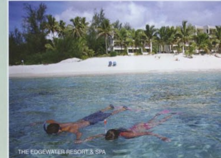
THE EDGEWATER RESORT & SPA

4-star resorts, SpaPolynesia features such delicious tropical delights as the 'Nita' Pawpaw Body Wrap, 'Tama' Coconut Scrub, and the 'Moana' AquaMarine Sea Salt Rub.