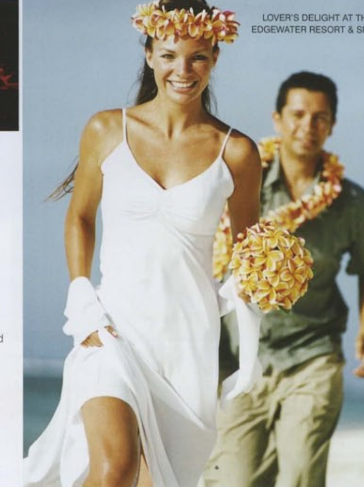
LOVER'S DELIGHT AT THE EDGEWATER RESORT & SPA

Manihiki, like many of the outer islands, doesn't make it onto most itineraries, which is a major part of its attraction. This stunning cluster of 40