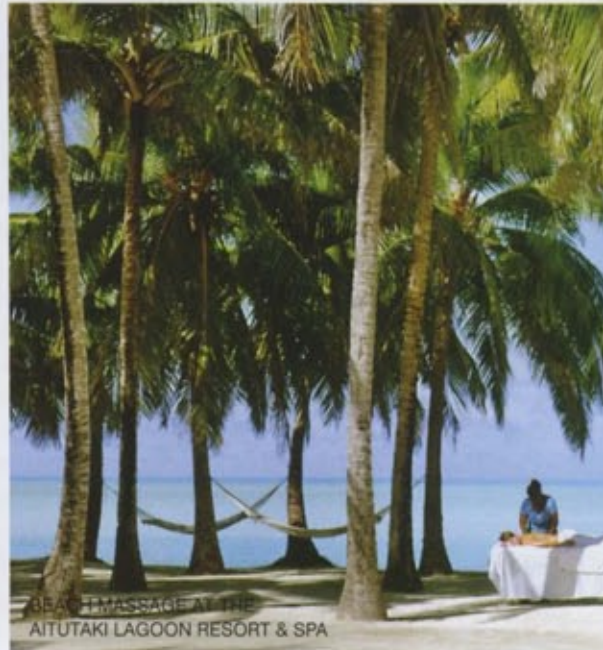
THE RAROTONGAN BEACH RESORT & SPA

A few days on low-slung, very laid-back Rarotonga is an ideal way to slip into the serenity which envelops the islands. By government decree, no building can be higher than a coconut palm, and – in scenes set to shake staid suburban sensibilities – roosters, chooks, pigs and goats roam freely while spontaneous conversations become a delightful inevitability. Here, people don't look straight past each other, rather, smiles and chat-stops rule the rhythm of the day.