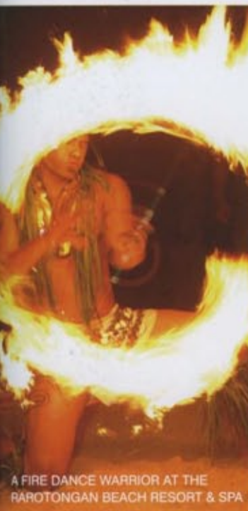
A FIRE DANCE WARRIOR AT THE RAROTONGAN BEACH RESORT & SPA

My pulse slowed and I too was breathing deeper and feeling like I'd had a long head massage. Pausing to smell the frangipanis became my priority.