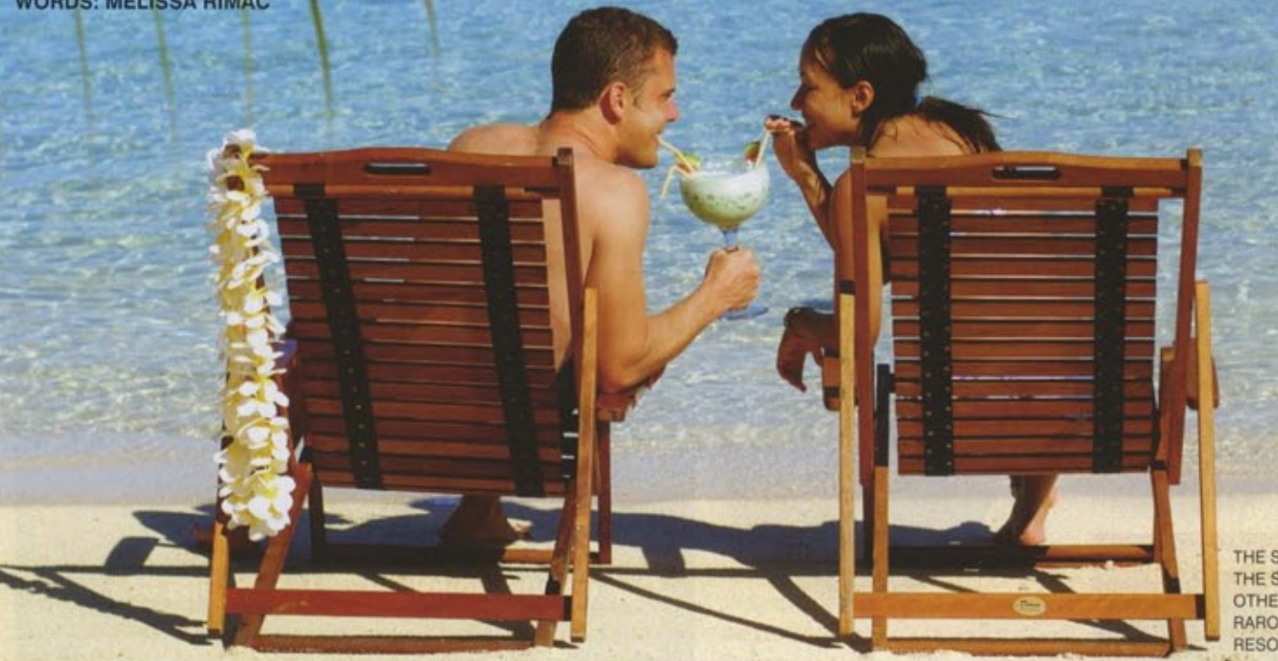
THE SUN, THE SEA... AND OTHER BUSS AT RAROTONGAN BEACH RESORT & SPA

Wanting turquoise lagoons, remote islands, glistening white beaches; an idyllic tropical haven far from the grind of 'progress'? It's a tall order, but the Cook Islands serve it up in spades.