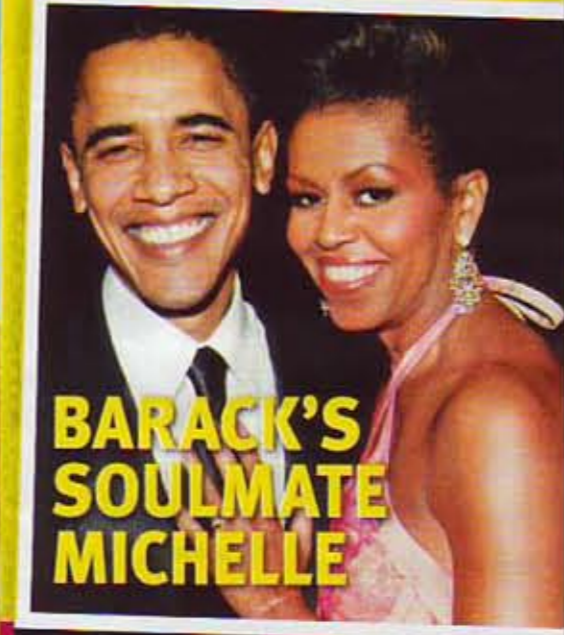
BARACK'S SOULMATE MICHELLE