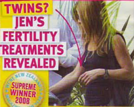
TWINS? JEN'S FERTILITY TREATMENTS REVEALED