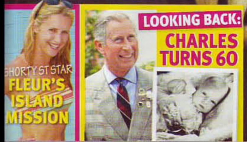
LOOKING BACK: CHARLES TURNS 60