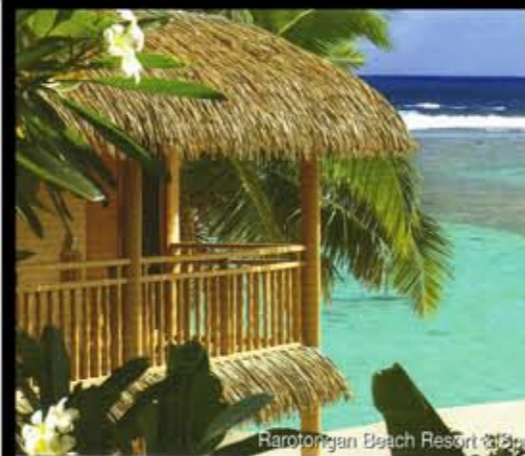
Rarotongan Beach Resort & Spa