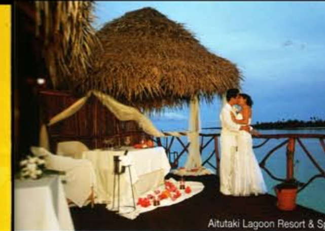
Aitutaki Lagoon Resort & Spa