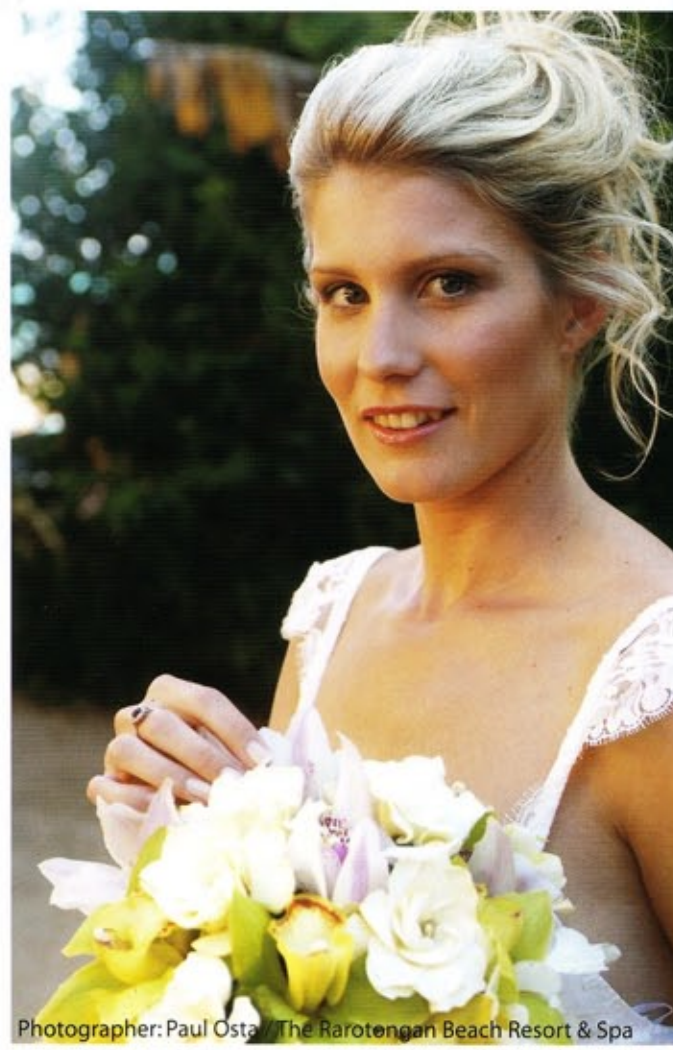
Flights, Weddings, Honeymoon, Bridal Registry, Cruise