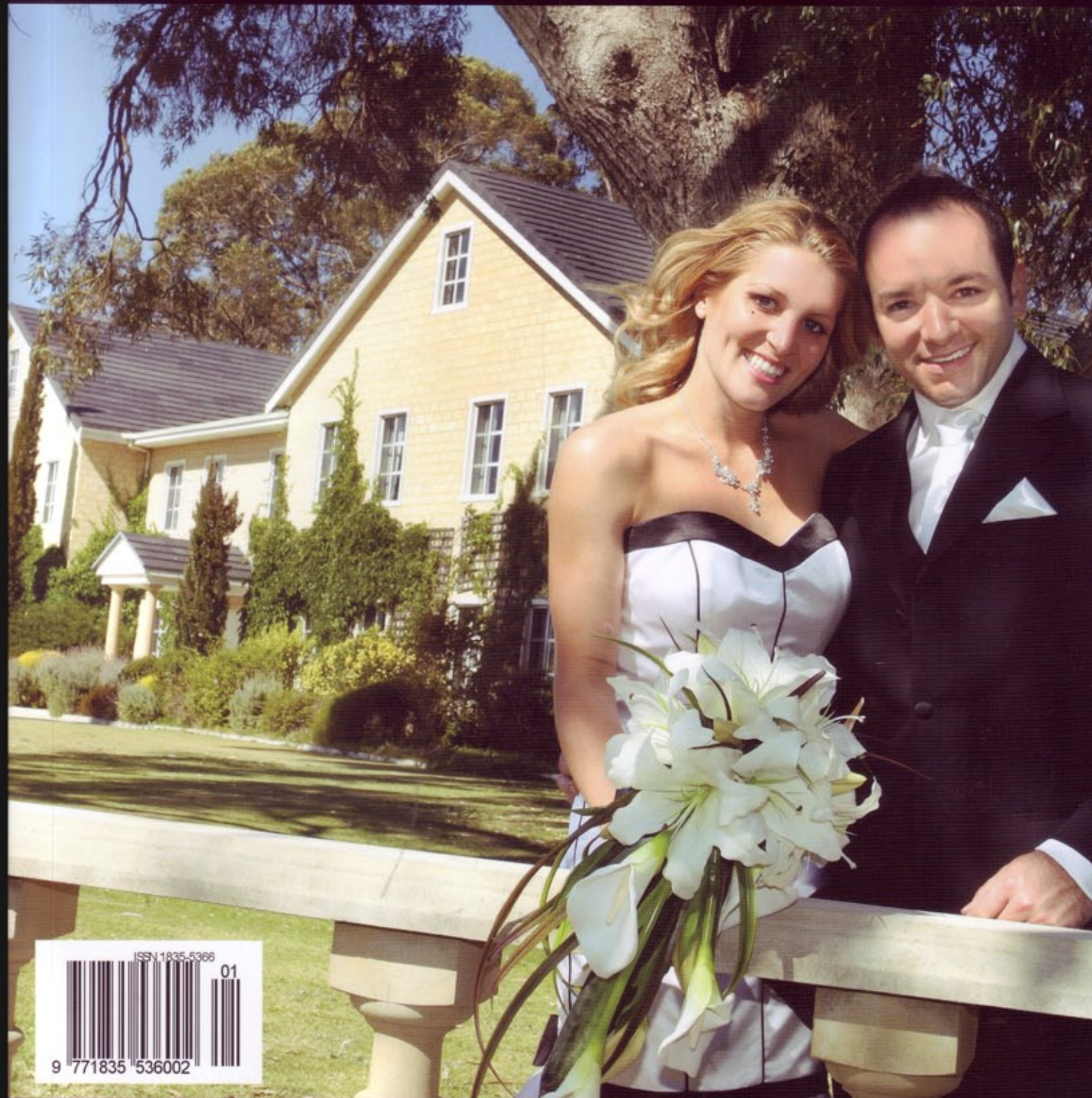
WA's Ultimate Guide To Wedding Venues & Services