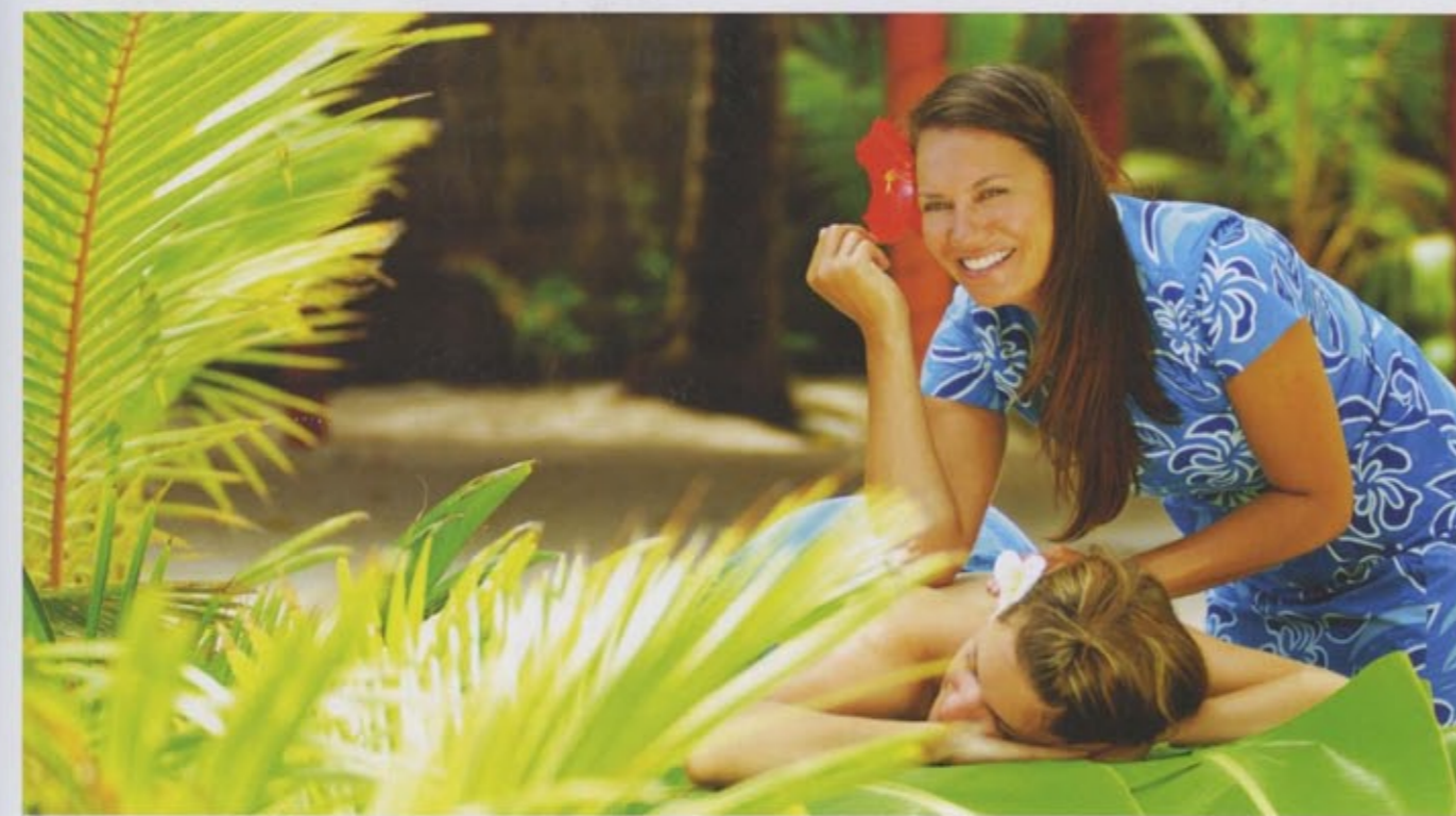
MAORI MASSAGE AT THE RAROTONGAN BEACH RESORT & SPA