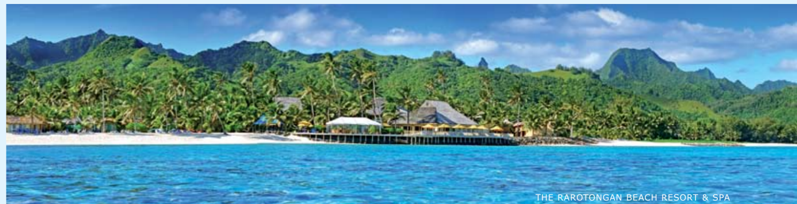
THE RAROTONGAN BEACH RESORT & SPA