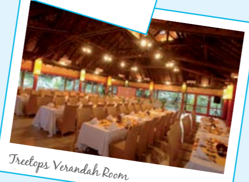
Treetops Verandah Room