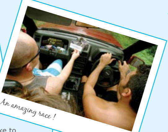
An amazing race!