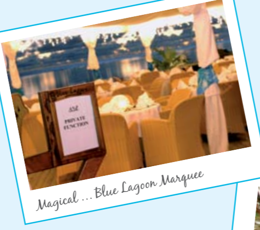
Magical ... Blue Lagoon Marquee