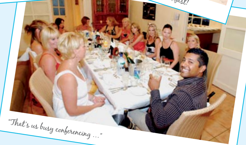
"That's us busy conferencing ..."