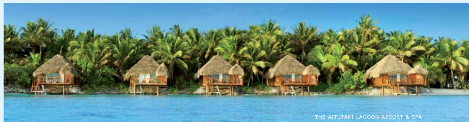
THE AITUTAKI LAGOON RESORT & SPA

Take your next meeting of the minds on location to Paradise, to the two best-located resorts in the Cook Islands.