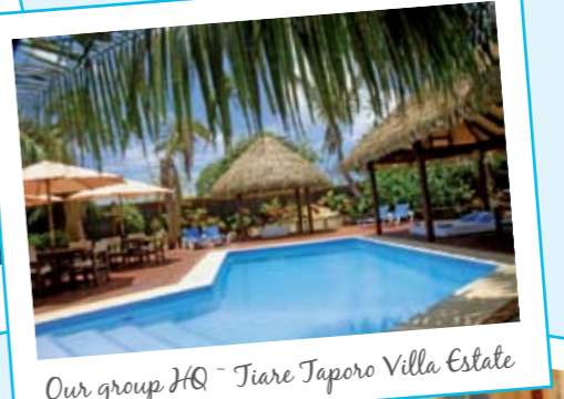
Our group HQ - Tiare Taporo Villa Estate