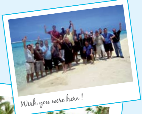
Wish you were here!