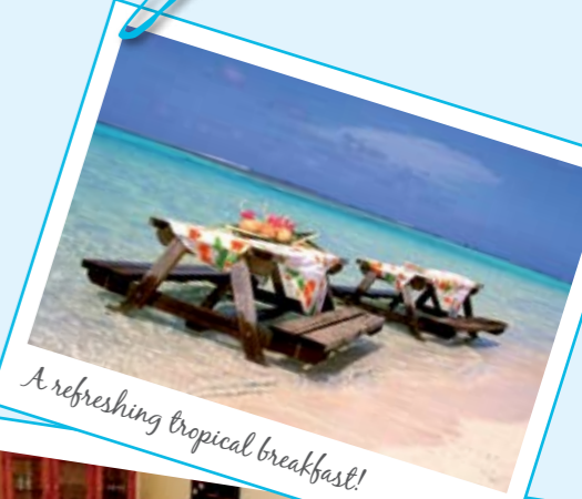
A refreshing tropical breakfast!

"The Company conference ran exceptionally well. Conference facilities worked well for us, the food was fabulous and everyone enjoyed themselves immensely. Team activities were varied and catered for all levels of people's abilities. The last activity, the 'Jeep Treasure Hunt', was a great way to round the conference off - really brilliant."