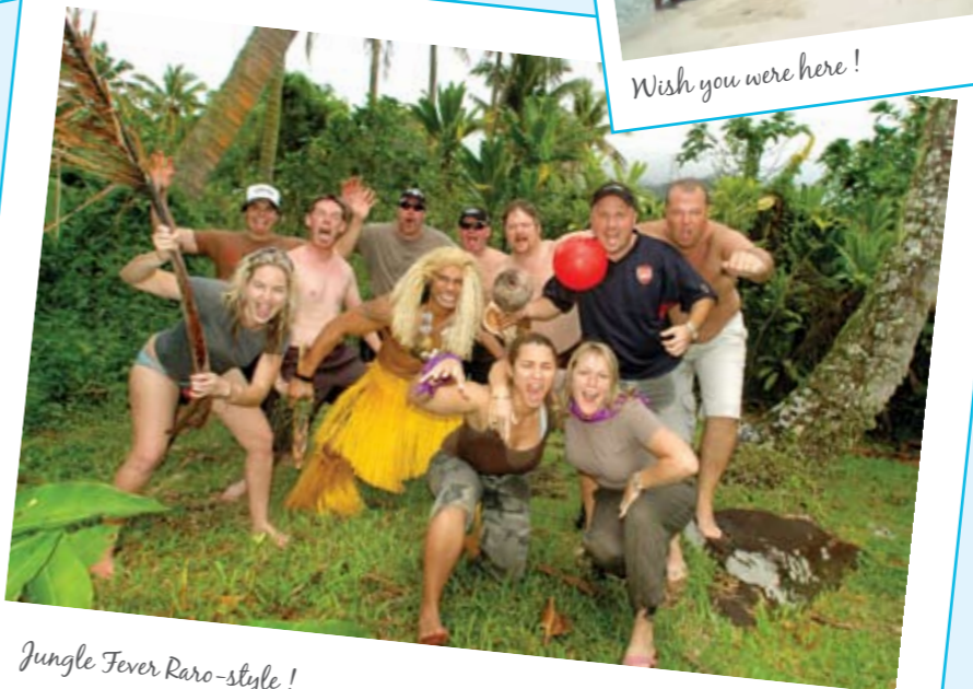
Jungle Fever Raro-style!