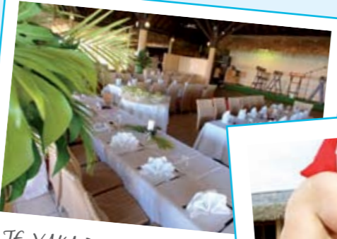
JE VAKA Restaurant