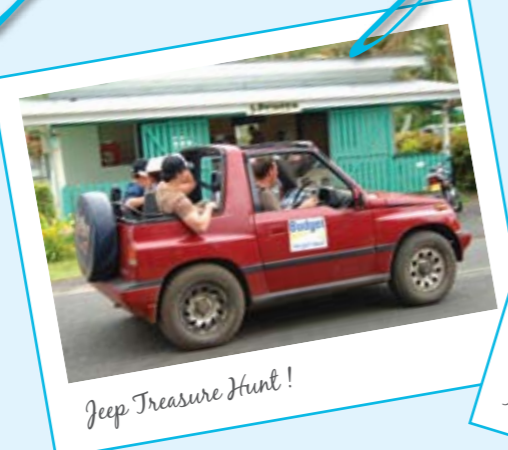
Jeep Treasure Hunt!