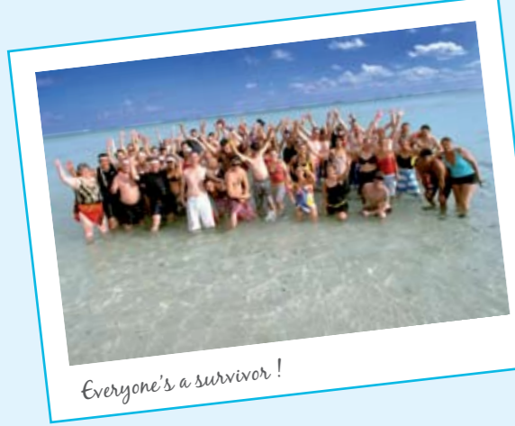
Everyone's a survivor!

"We try to pick a location that's unique as a reward for our folks, one which will create good memories for our people, somewhere new and different where it's likely they wouldn't have already been.