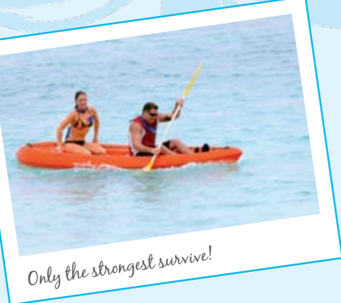
Only the strongest survive!