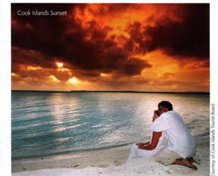
Cook Islands Sunset

The Little Polynesian is great for those who want an intimate wedding. Getting married on this beachfront resort would be the ultimate storybook romance experience.